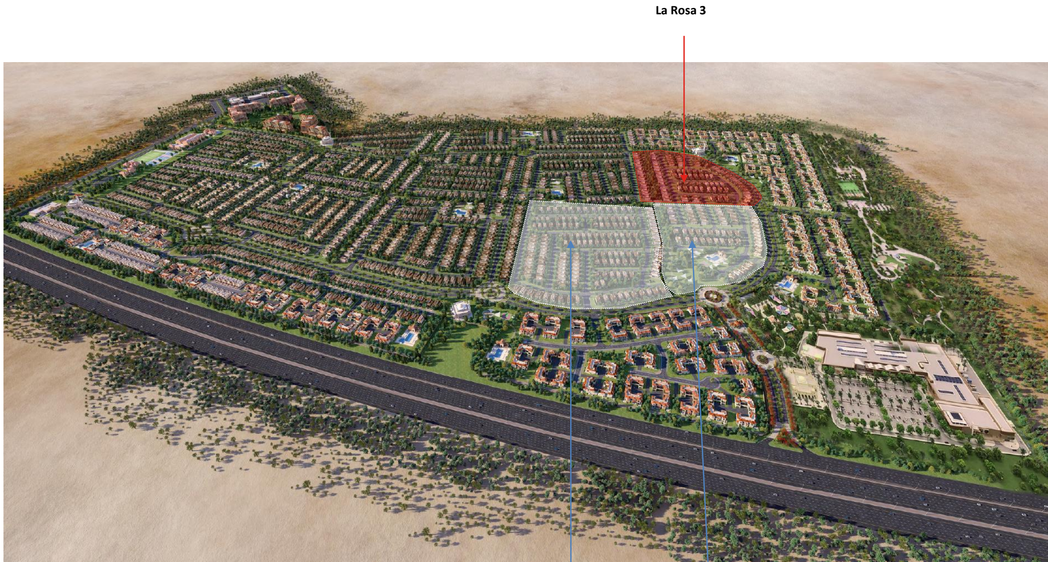
La Rosa 3