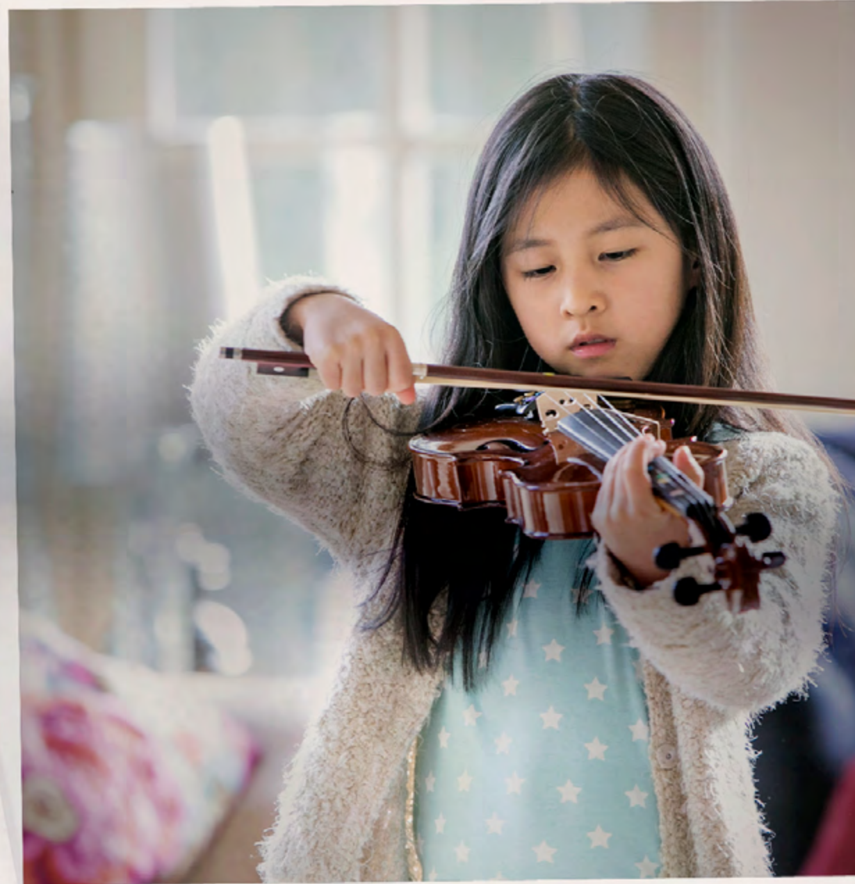
MORE ROOM FOR GROWTH