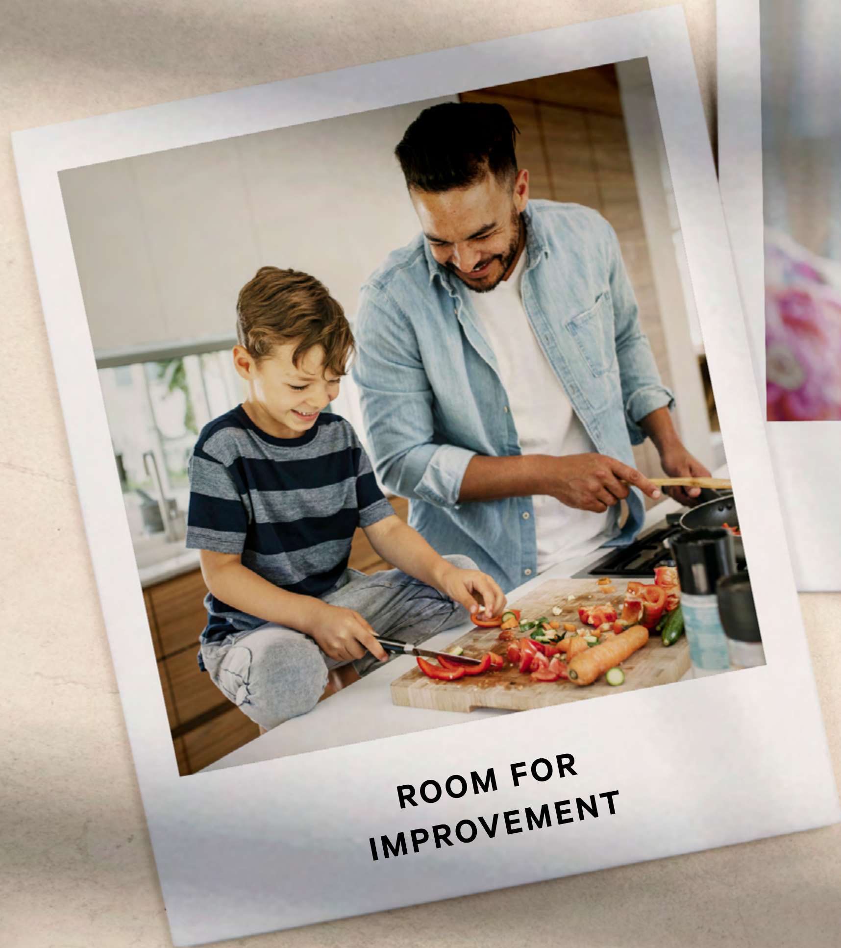
ROOM FOR IMPROVEMENT