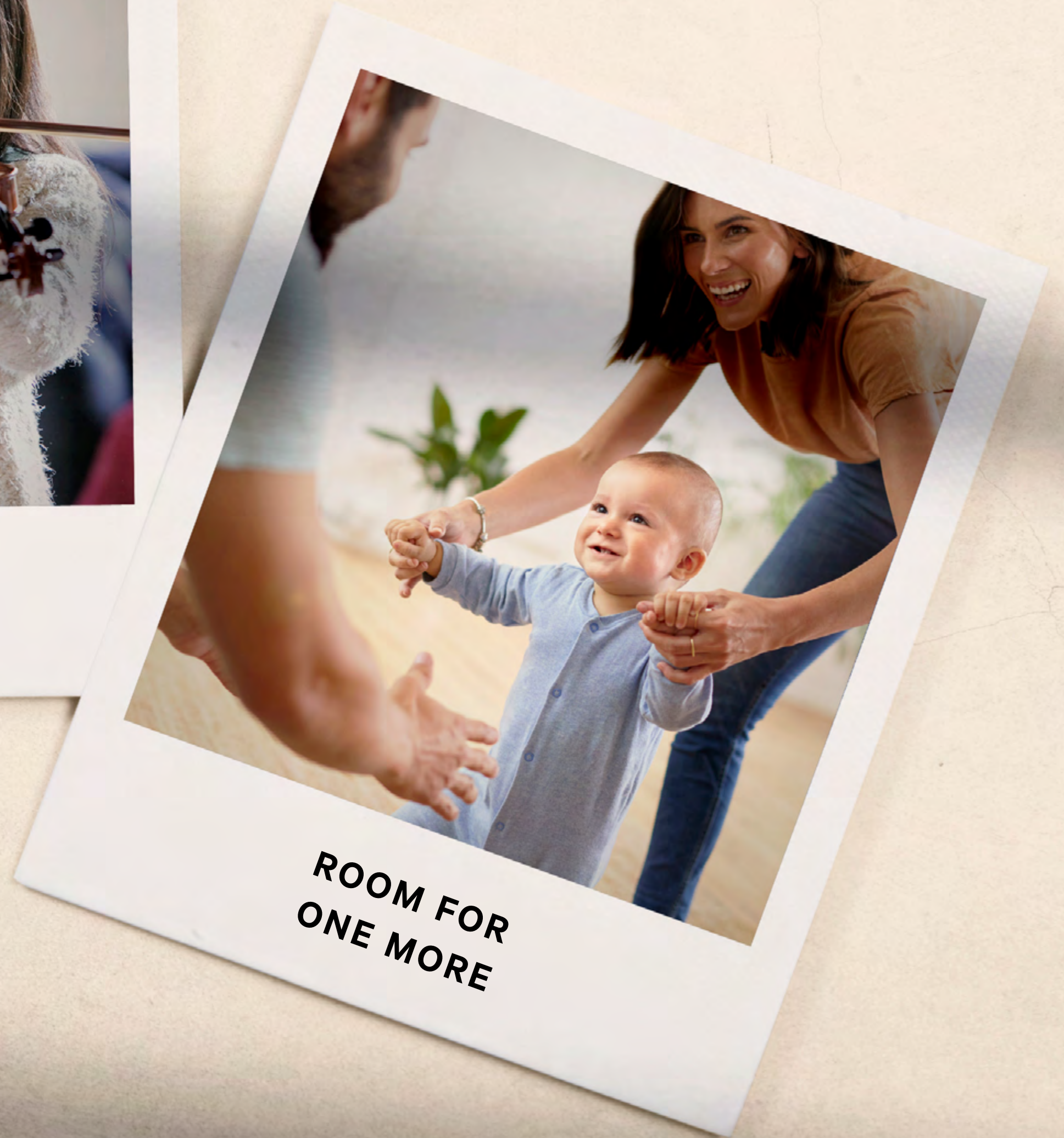
ROOM FOR ONE MORE