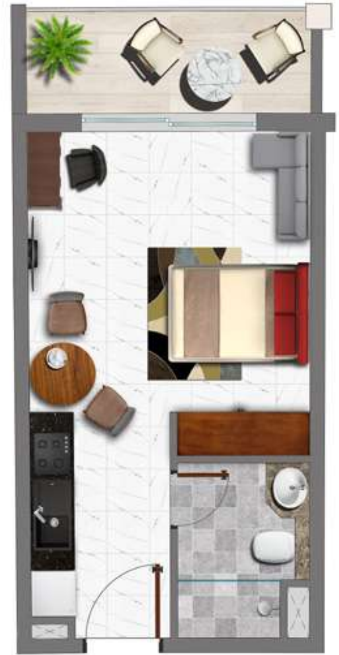
LUXURIOUS STUDIO LIVING