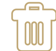
Ingenious waste disposal system