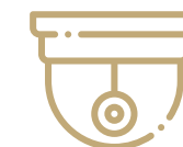
Sophisticated security system