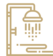
Luxurious bathroom fittings