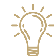
Lighting & fixtures