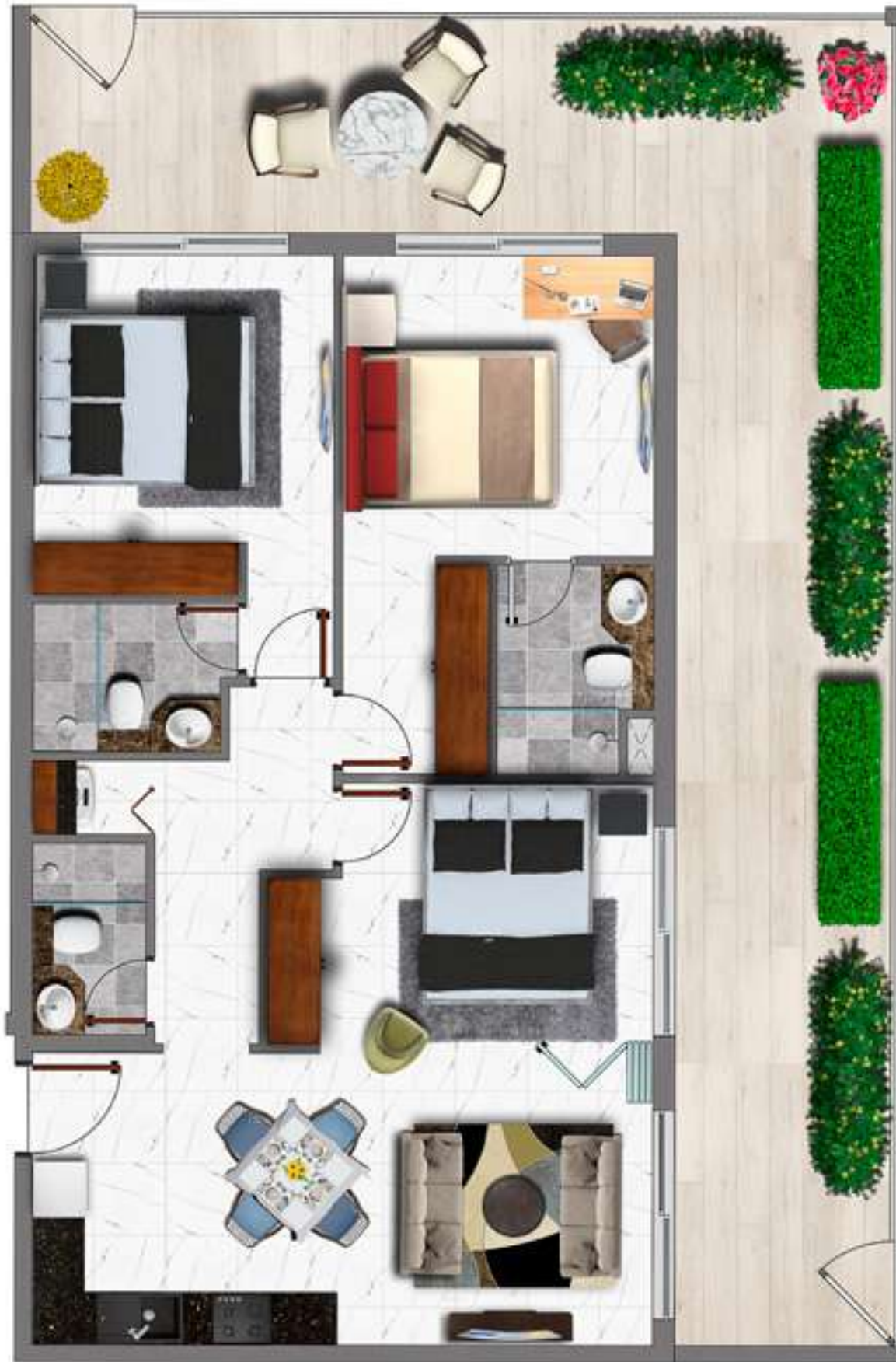
ALLURING 3 BHK