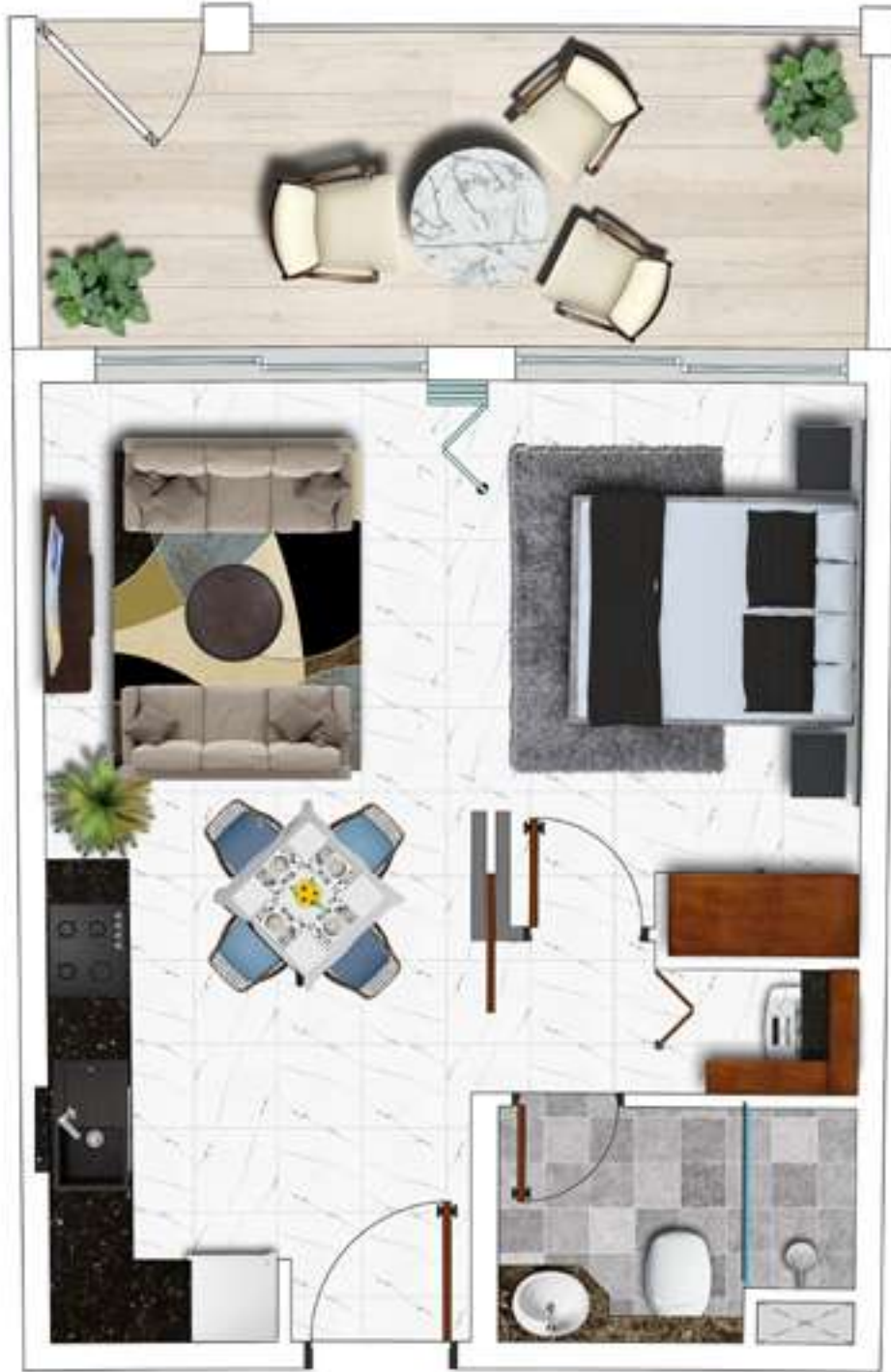
SPLendid 1 BHK