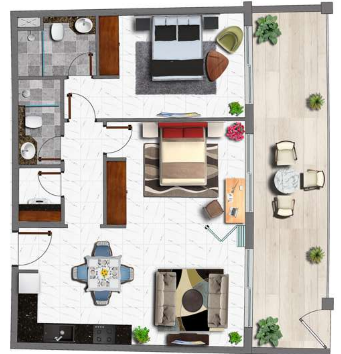
LAVISH 2 BHK