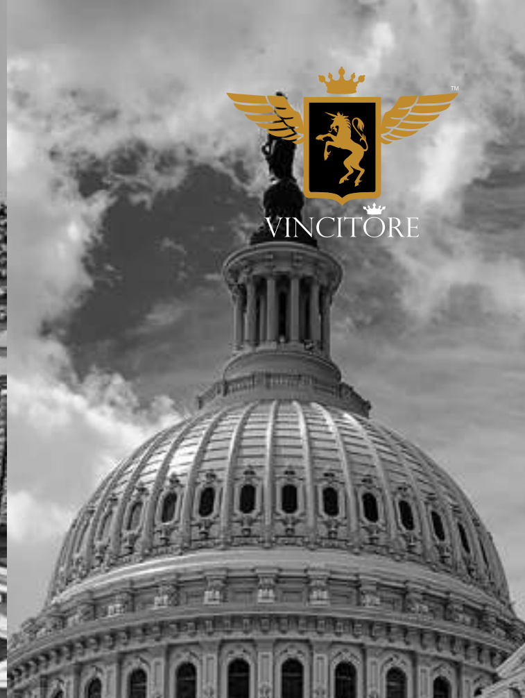
US CAPITOL Neoclassical architecture