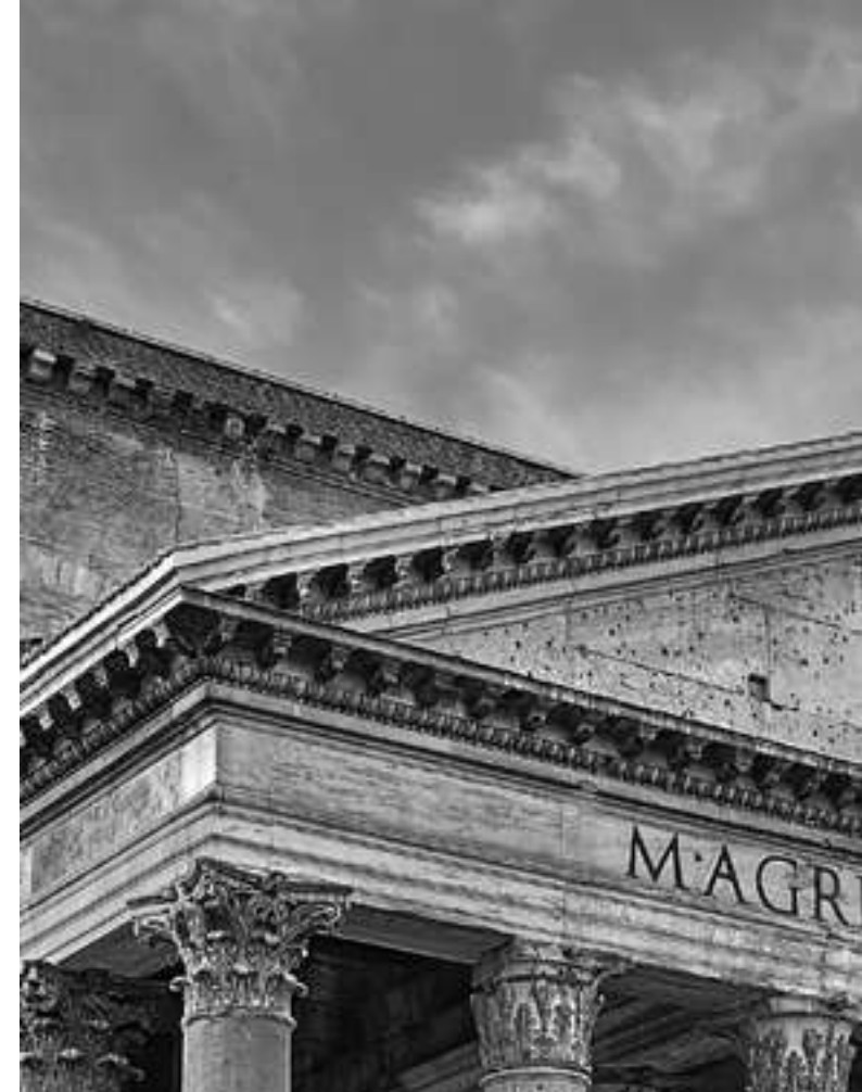
PANTHEON Ancient roman architecture

Benessere is inspired by the legacy of architecture that's almost two millennia old. But don't worry your palatial retreat will be ready in 2021 as we have our own legacy and reputation of timely delivery to preserve.