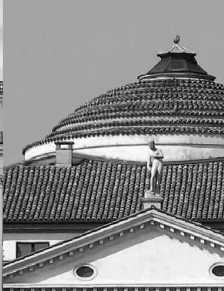
VILLA CAPRA Palladianism