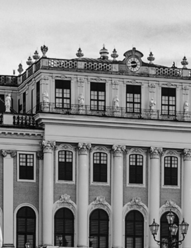
SCHONBRUNN PALACE Boroque architecture