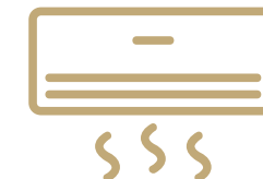
World-class air-conditioning system