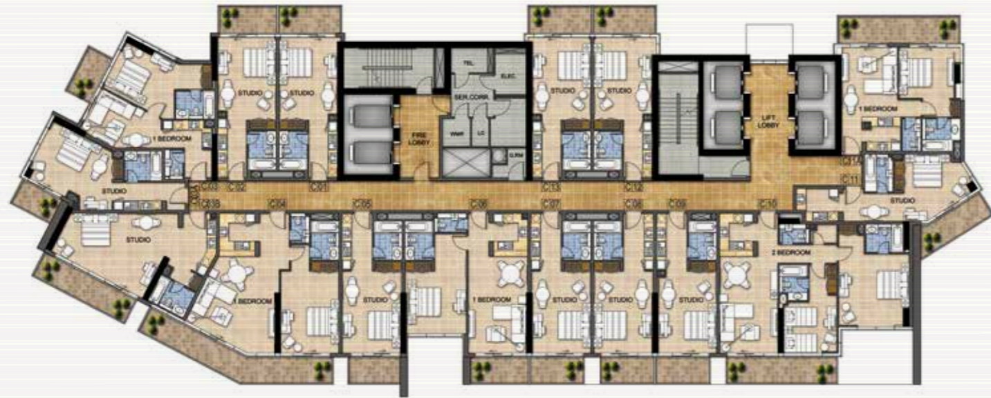
LEVELS 4-7 9-10 12-13 & 15