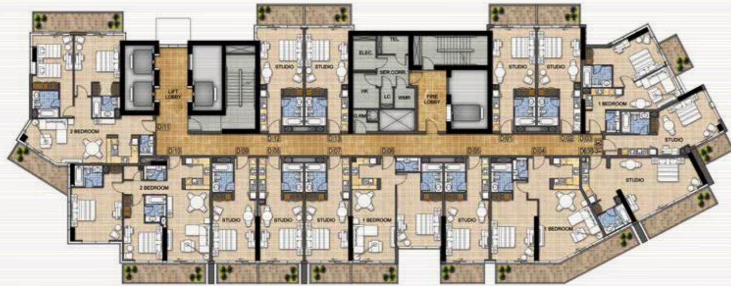
LEVELS 4-6 9-12