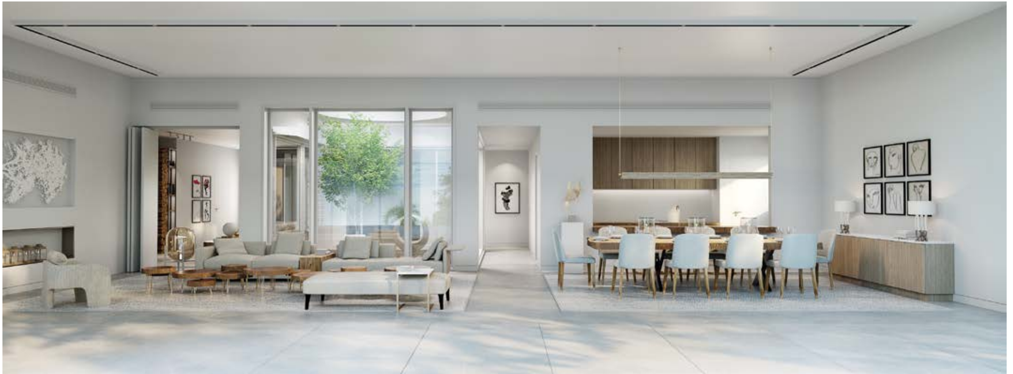
Living and dining