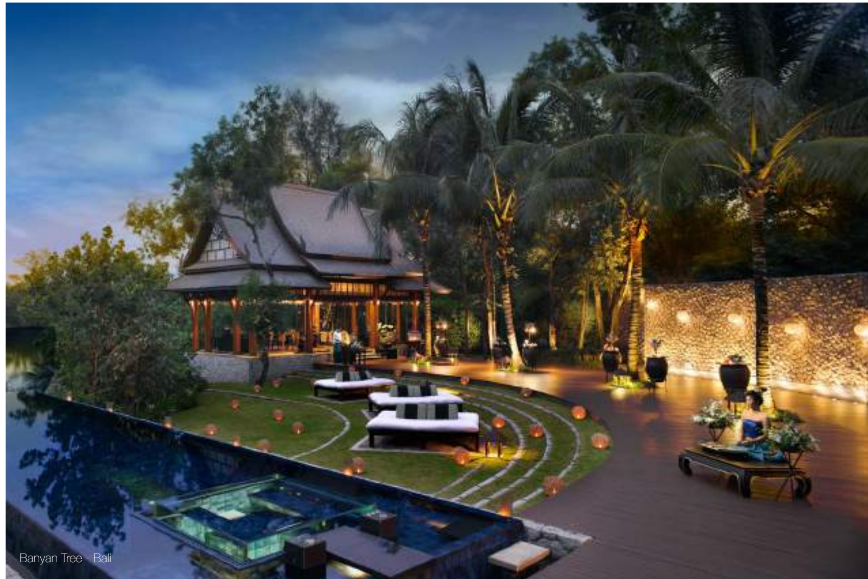
Banyan Tree - Bali