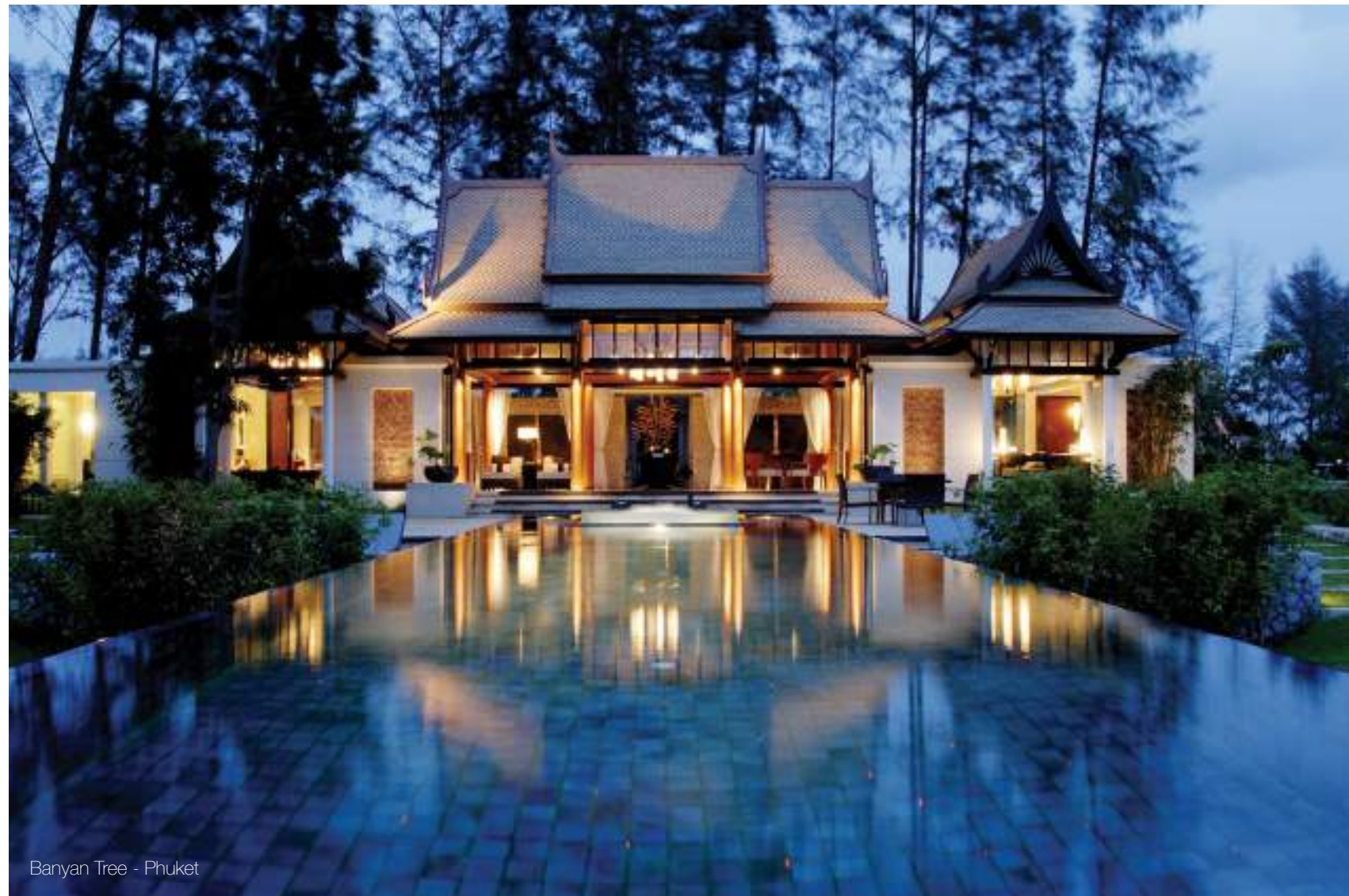
Banyan Tree - Phuket