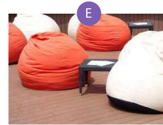
E OUTDOOR COURTYARD