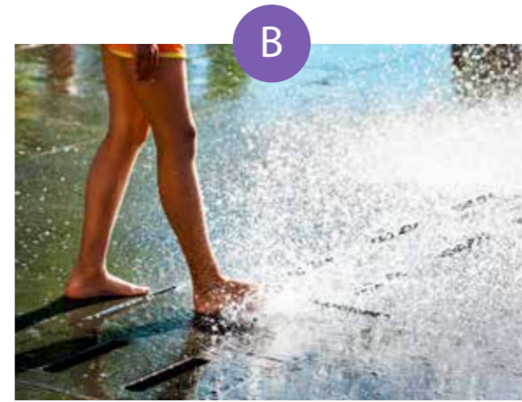
B WATER PLAY