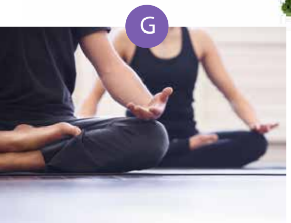
G YOGA | MEDITATION AREA