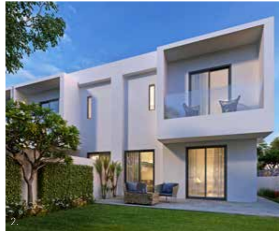
1. Master bedroom 2. Exterior rear view 3. Exterior front view