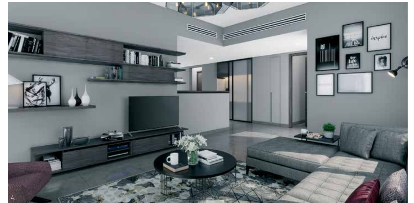
Grey Scheme 1. Living and dining room 2. Kitchen 3. Entry hallway 4. Family living room All homes are available in either the grey scheme or the beige scheme based on customer preference.