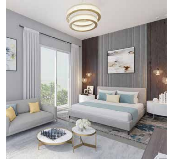
Grey Scheme 1. Dining room 2. Kitchen 3. Family bathroom 4. Master bedroom All homes are available in either the grey scheme or the beige scheme based on customer preference.