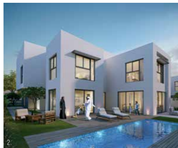
1. Master bedroom 2. Exterior rear view 3. Exterior front view