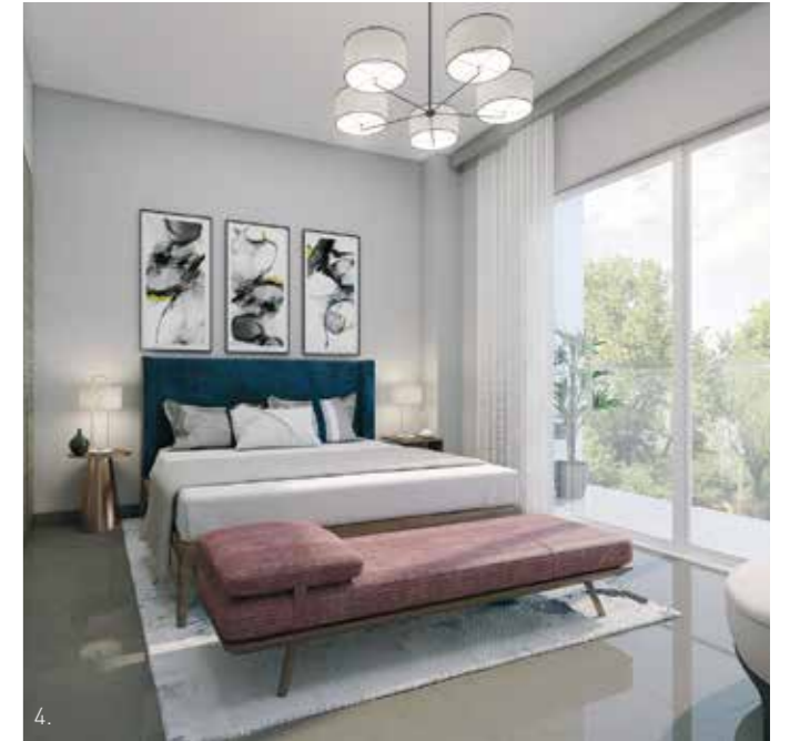
Grey Scheme 1. Living room 2. Kitchen 3. Family room 4. Master bedroom All homes are available in either the grey scheme or the beige scheme based on customer preference.