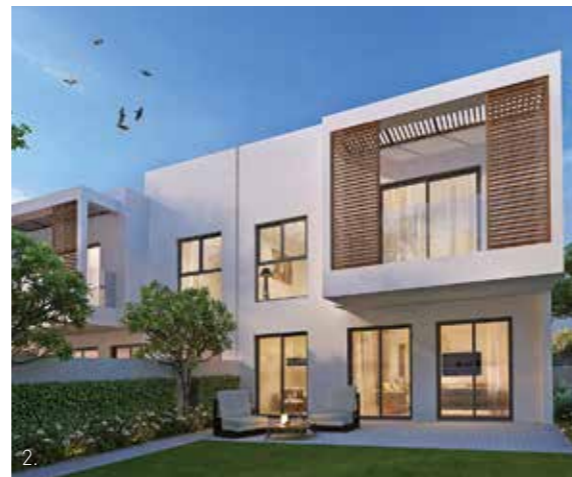
1. Living room 2. Exterior rear view 3. Exterior front view