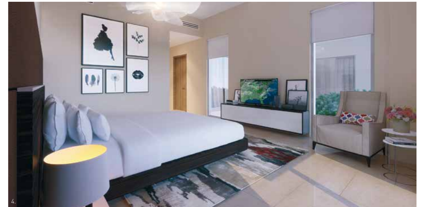
Beige Scheme 1. Living room 2. Kitchen 3. Family bathroom 4. Master bedroom All homes are available in either the grey scheme or the beige scheme based on customer preference.