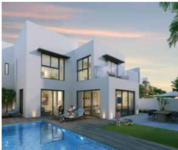
1. Family living room 2. Exterior rear view 3. Exterior front view