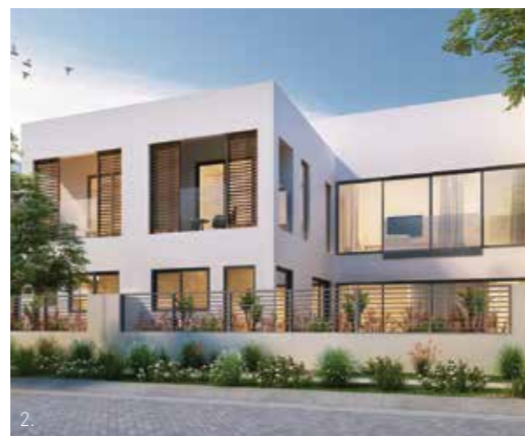
1. Family living room 2. Exterior side view 3. Exterior front view