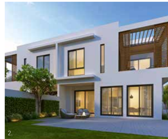
1. Living room 2. Exterior rear view 3. Exterior front view