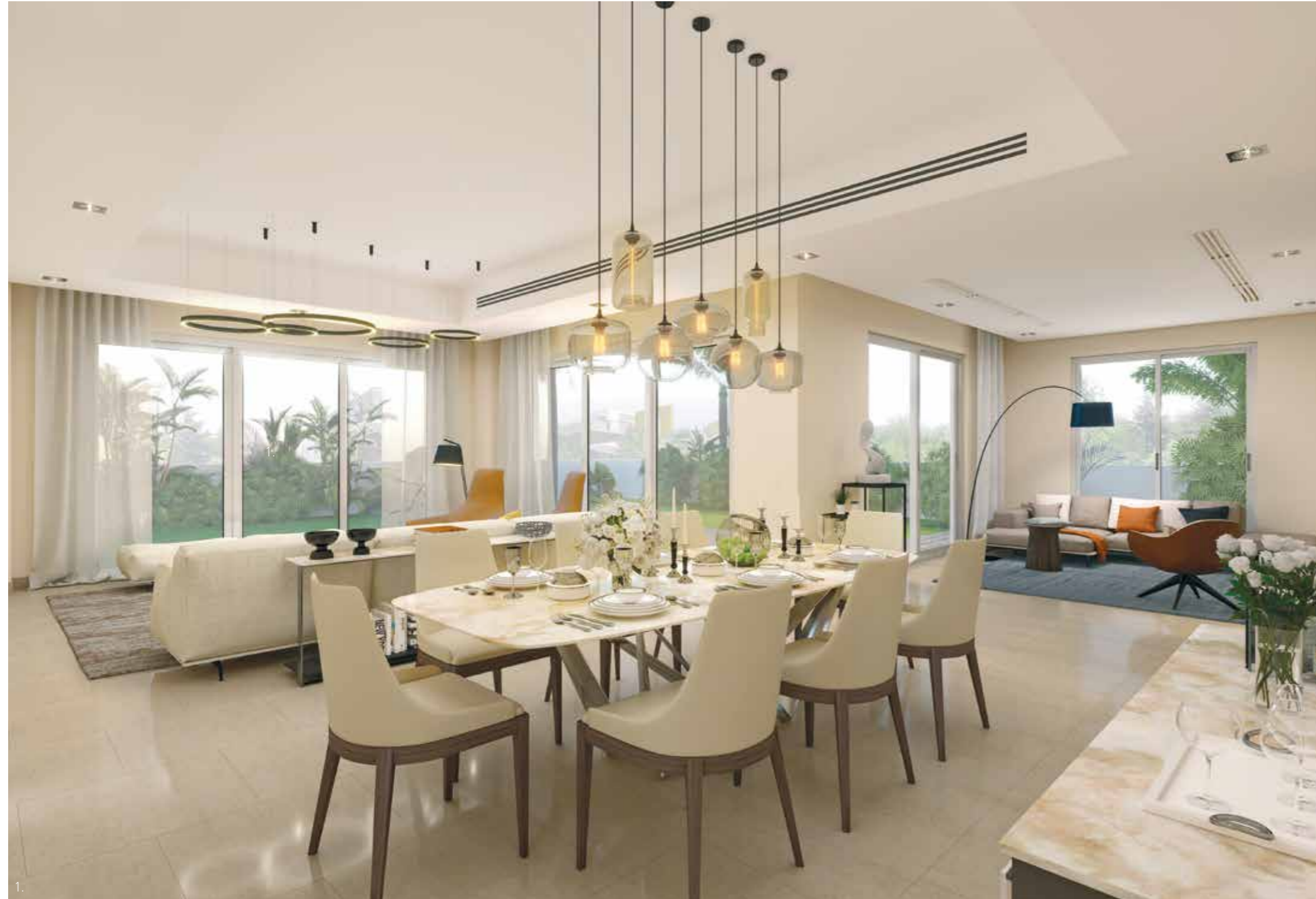
Beige Scheme 1. Living room 2. Kitchen 3. Master bathroom 4. Master bedroom All homes are available in either the grey scheme or the beige scheme based on customer preference.