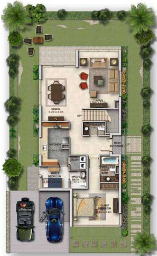
V-2 / L-2 GROUND FLOOR