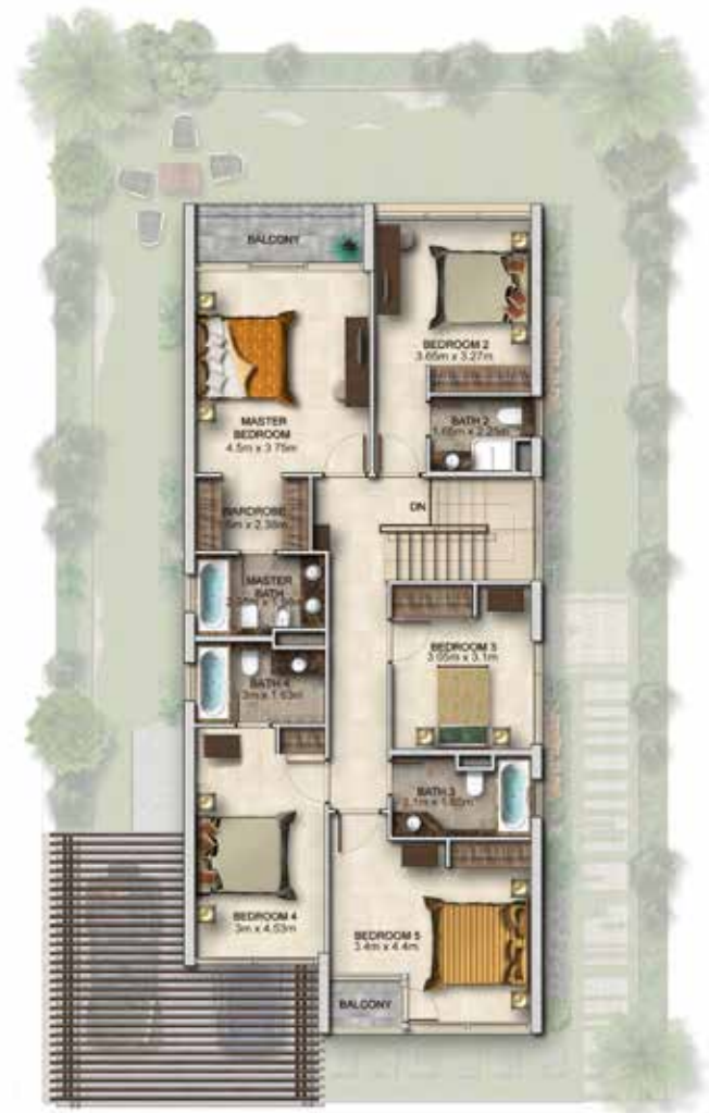
V-2 / L-2 FIRST FLOOR

V-2 available in Aster, Claret, Coursetia, Juniper, Mulberry, Odora, Pacifica, Primrose, Sycamore, Zinnia L-2 available in Acuna, Centaury, Janusia, Pacifica, Sanctnary, Trixis