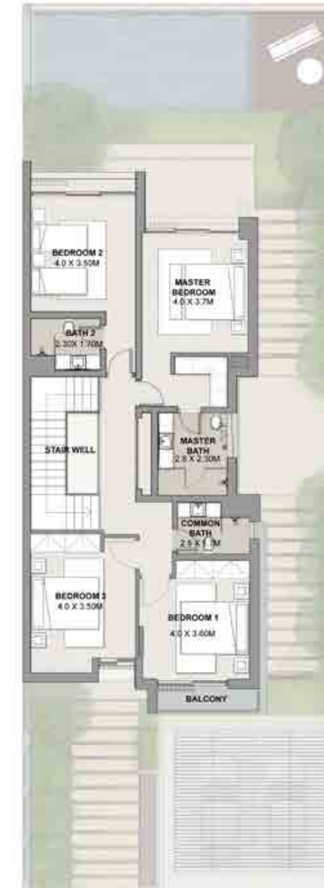
TH-L-A FIRST FLOOR