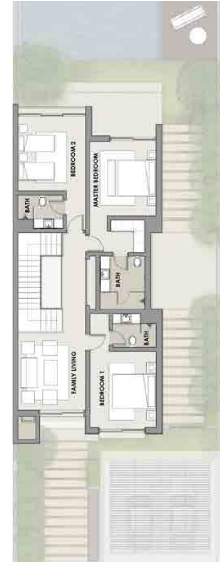
TH-L FIRST FLOOR

Disclaimer: Unless stated otherwise, all accessories and interior finishes such as wallpaper, chandeliers, furniture, electronics, white goods, curtains, hard and soft landscaping, pavements, features, swimming pool(s) and other elements displayed in the brochure, or within the show apartment or between the plot boundary and the unit, are not part of the standard unit and are shown for illustrative purposes only.