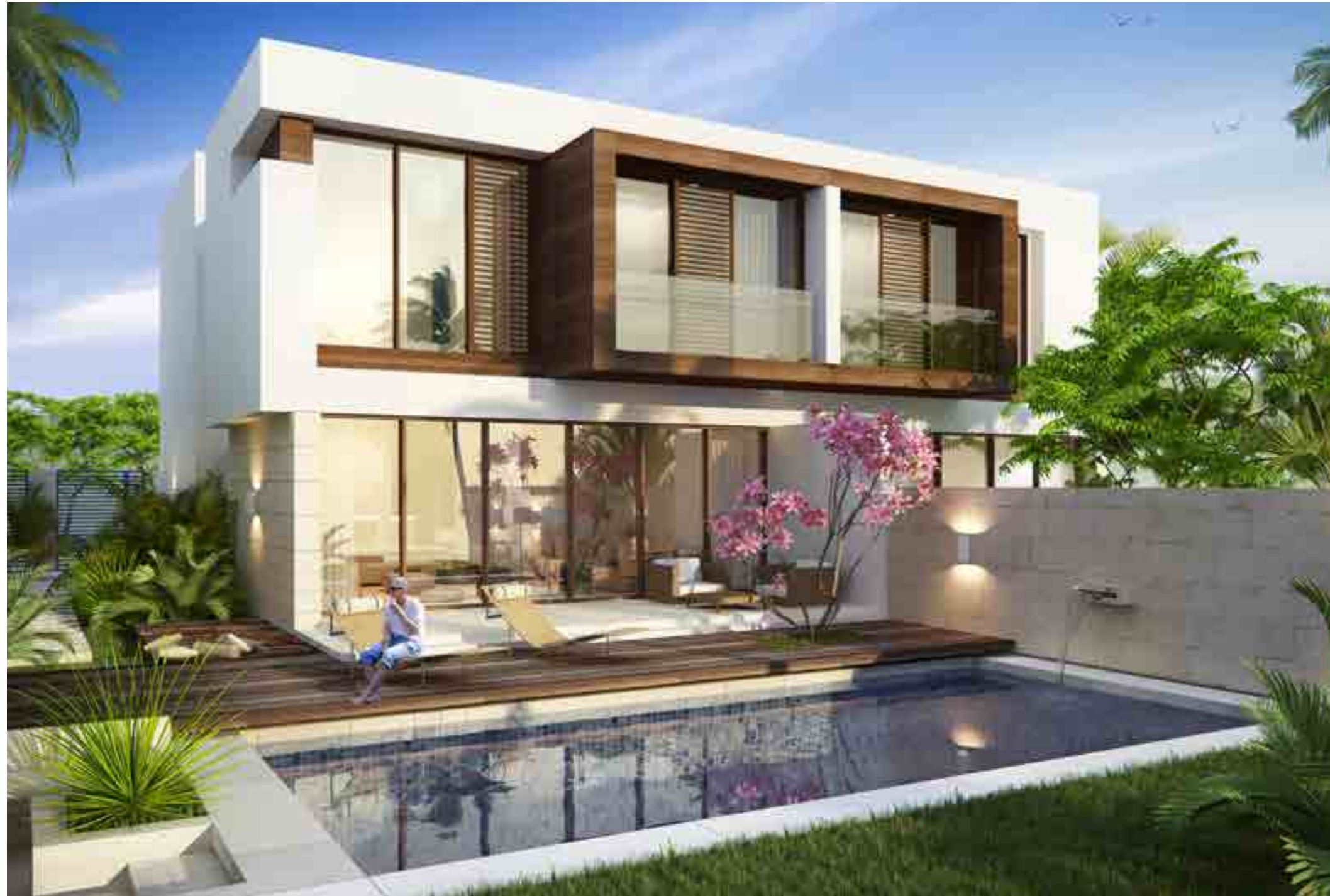
TH-L-A / TH-L