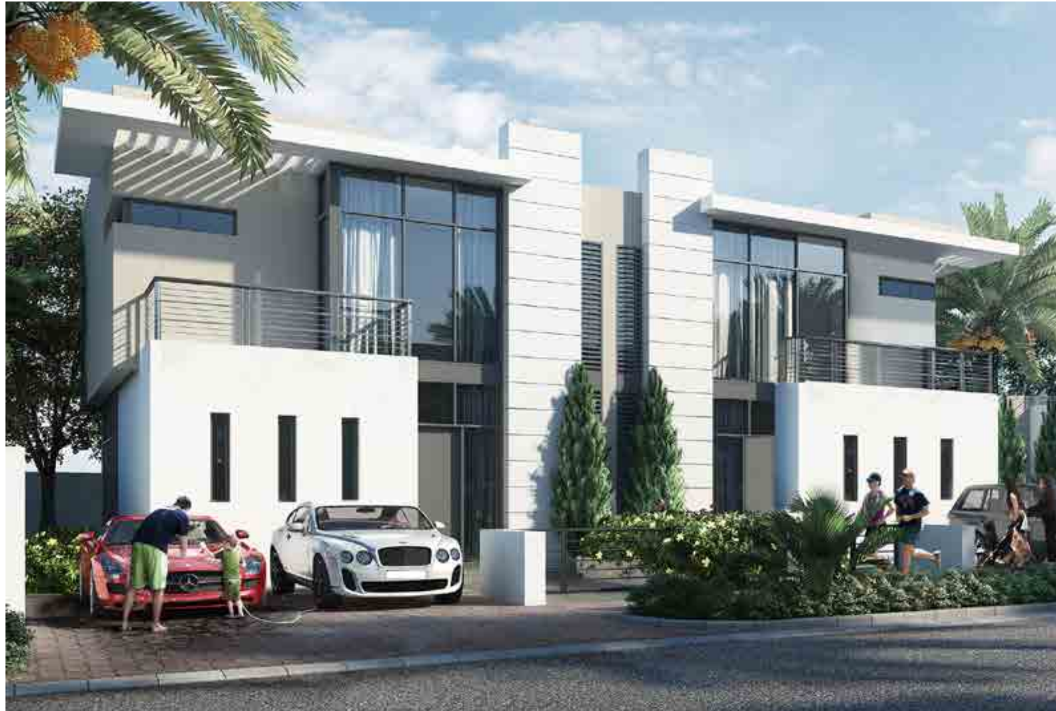
TH-M / TH-M-D