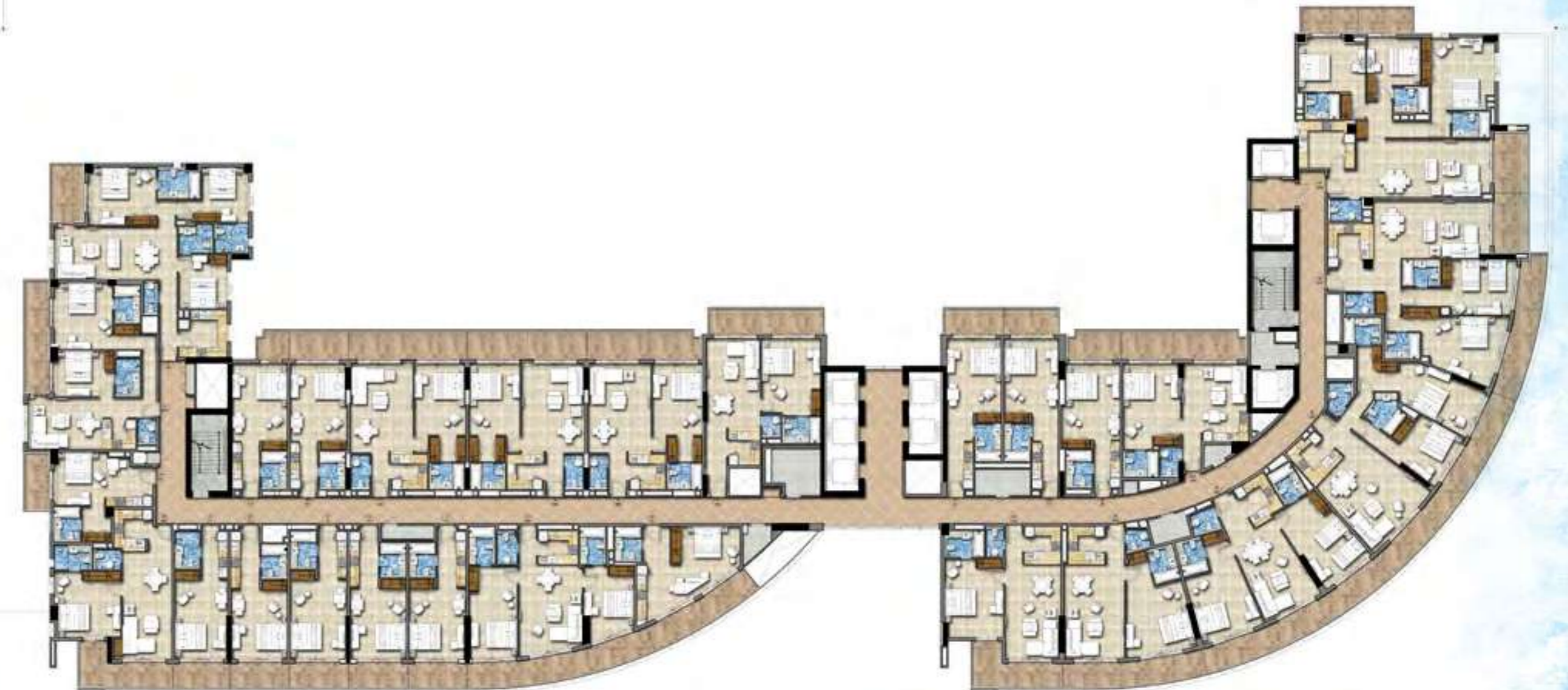
TYPICAL FLOOR PLAN Level 14

Disclaimer: All pictures, plans, layouts, information, data and details included in this brochure are indicative only and may change at any time up to the final 'as built' status in accordance with final designs of the project, regulatory approvals and planning permissions.