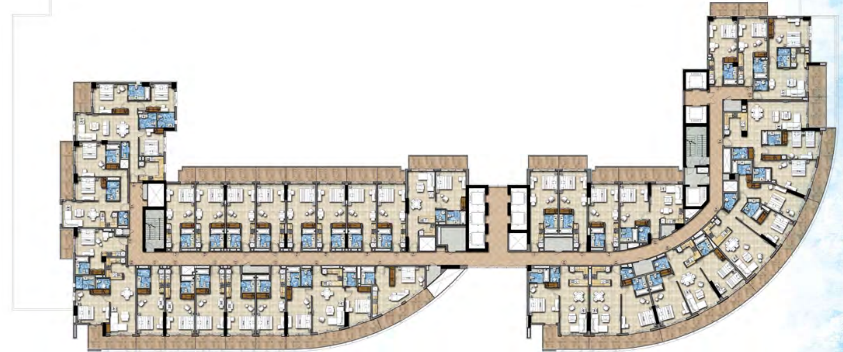
TYPICAL FLOOR PLAN Levels 9, 11, 12, 16 and 17

Disclaimer: All pictures, plans, layouts, information, data and details included in this brochure are indicative only and may change at any time up to the final 'as built' status in accordance with final designs of the project, regulatory approvals and planning permissions.