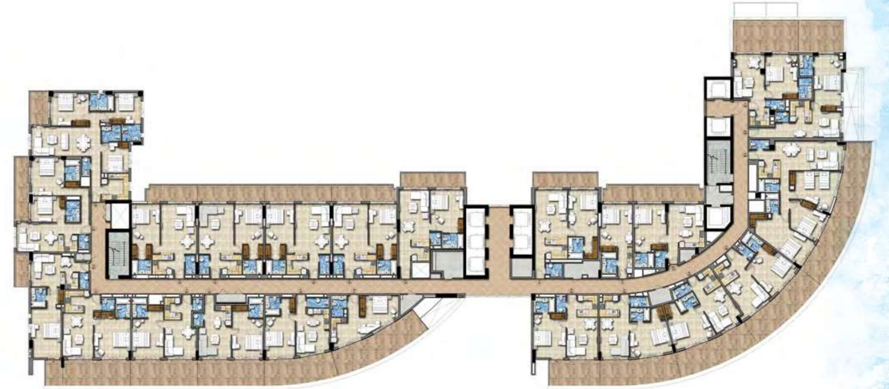
TYPICAL FLOOR PLAN Level 18

Disclaimer: All pictures, plans, layouts, information, data and details included in this brochure are indicative only and may change at any time up to the final 'as built' status in accordance with final designs of the project, regulatory approvals and planning permissions.