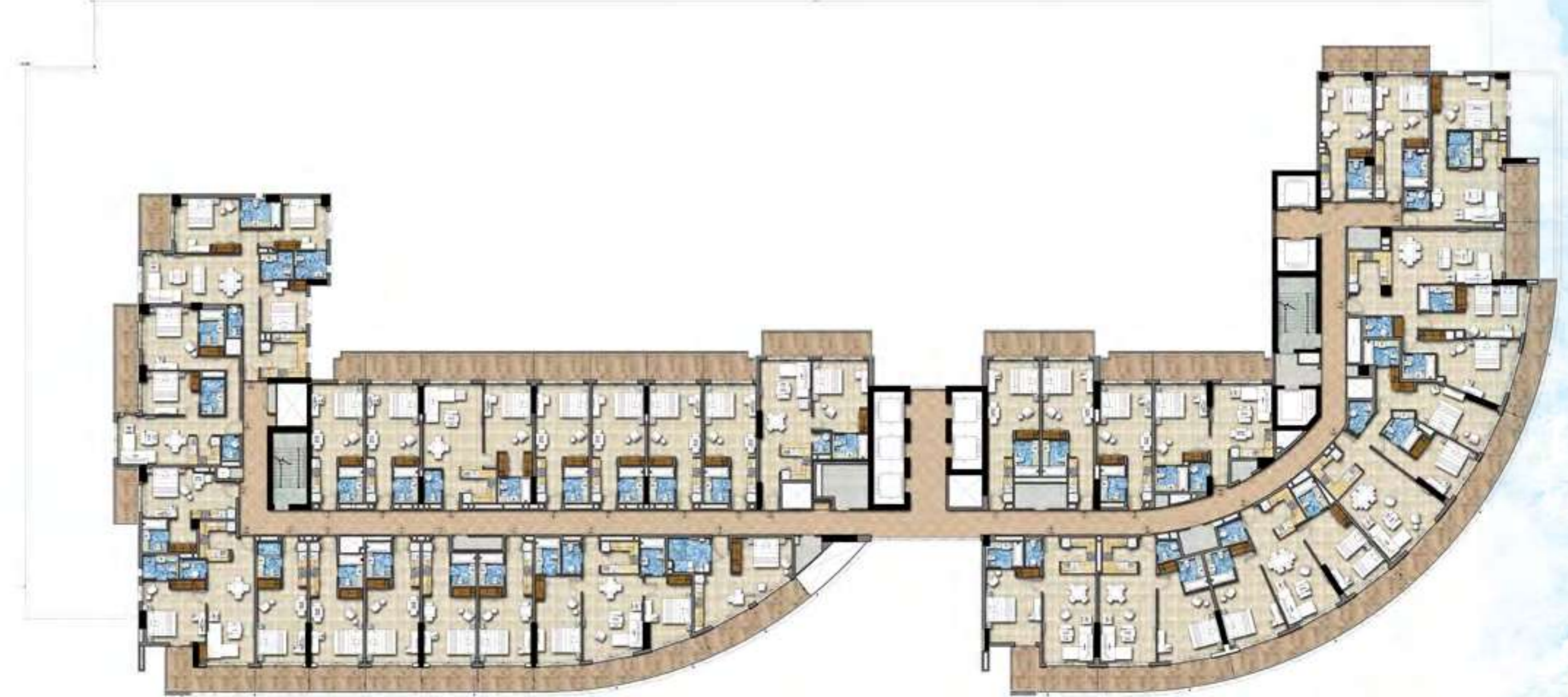
TYPICAL FLOOR PLAN Level 7

Disclaimer: All pictures, plans, layouts, information, data and details included in this brochure are indicative only and may change at any time up to the final 'as built' status in accordance with final designs of the project, regulatory approvals and planning permissions.