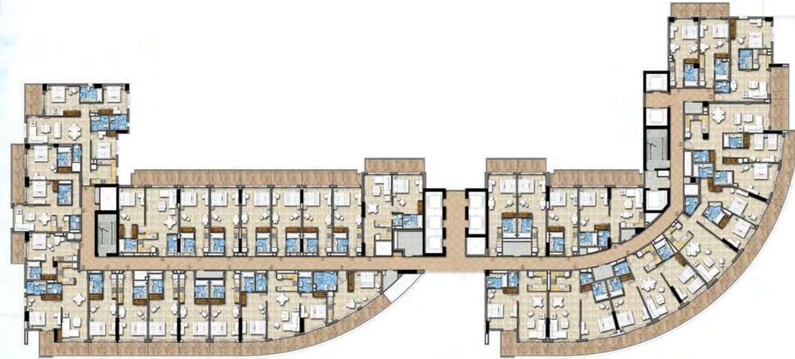
TYPICAL FLOOR PLAN Level 8

Disclaimer: All pictures, plans, layouts, information, data and details included in this brochure are indicative only and may change at any time up to the final 'as built' status in accordance with final designs of the project, regulatory approvals and planning permissions.