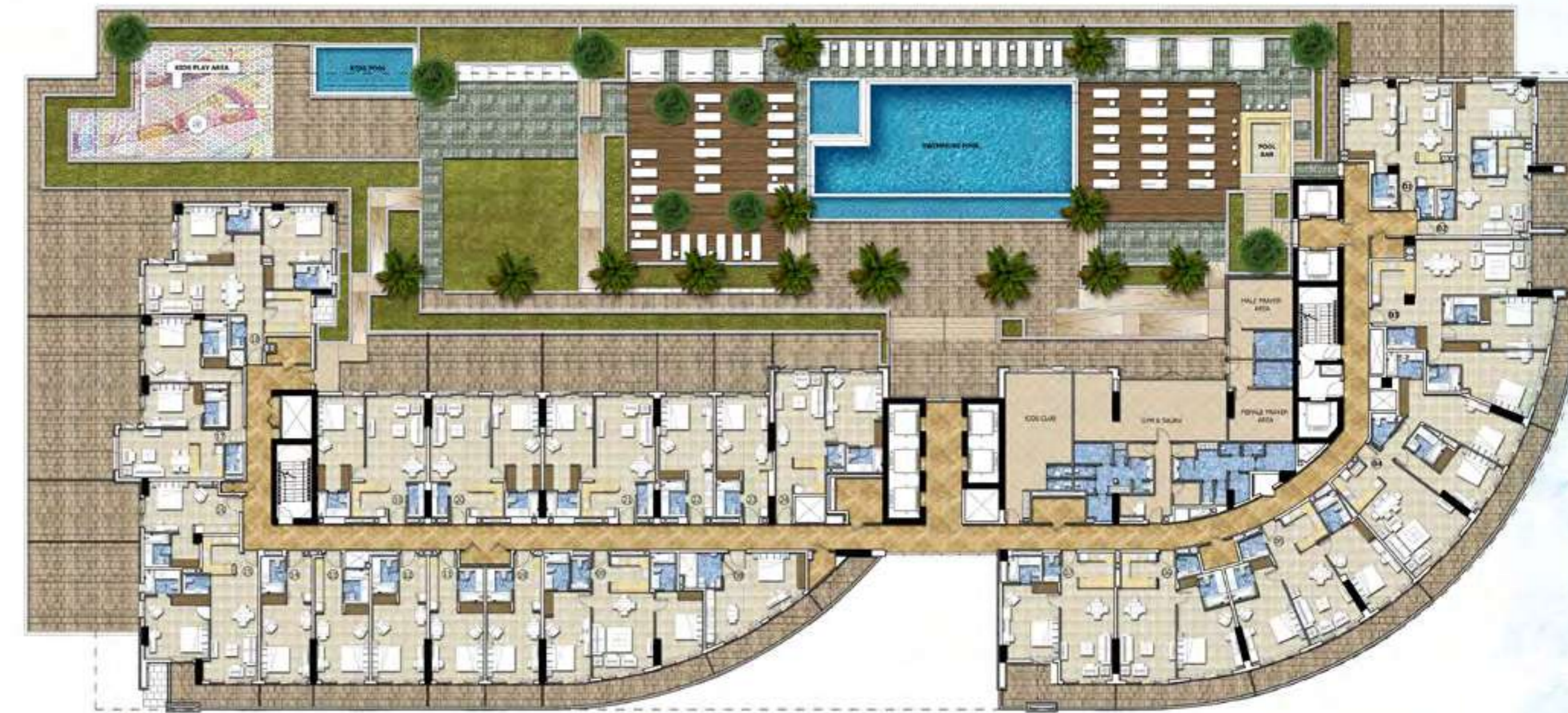
TYPICAL FLOOR PLAN Level 4 (Amenities)

Disclaimer: All pictures, plans, layouts, information, data and details included in this brochure are indicative only and may change at any time up to the final 'as built' status in accordance with final designs of the project, regulatory approvals and planning permissions.