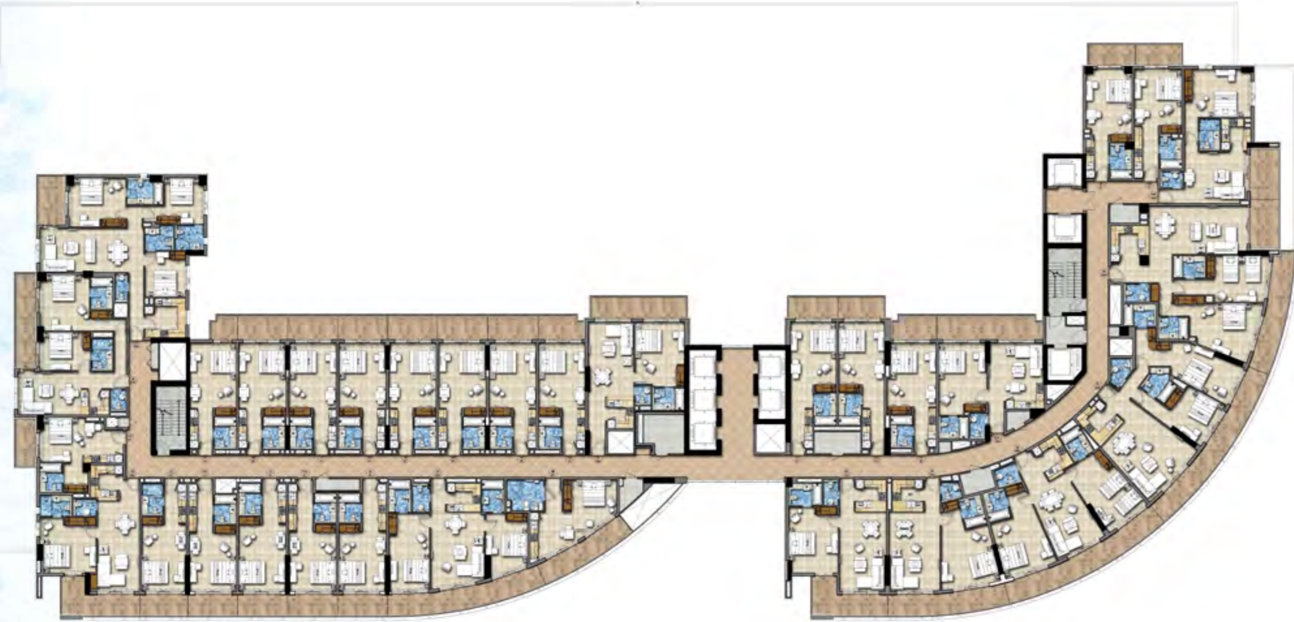
TYPICAL FLOOR PLAN Levels 5 and 6

Disclaimer: All pictures, plans, layouts, information, data and details included in this brochure are indicative only and may change at any time up to the final 'as built' status in accordance with final designs of the project, regulatory approvals and planning permissions.